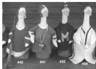
Sports Goose (left) and friends at Duck City 2000

Sports Goose - A multi-purpose sporting goose capable of majestic sporting achievements (pomegranate throwing a speciality) but often too ill to compete. More often than not confined to his bed to drink Lemsip and watch videos of old Cup Finals. His last major success came in the New York Half Marathon For Ducks And Wildfowl where he completed the final mile in a staggering 4.8 seconds. All set to defend the title twelve months later but struck down by bronchitis at the eleventh hour but recovered sufficiently to finish runner-up at Duck City 2000 in his fantastic beetroot car.