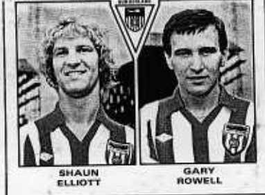
Midfield. Ht.5.11.Wt.10.6. No other club. ■41, C1.