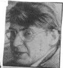
HATED: Killer Nilsen